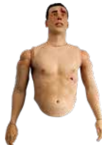
Active Shooter Upper