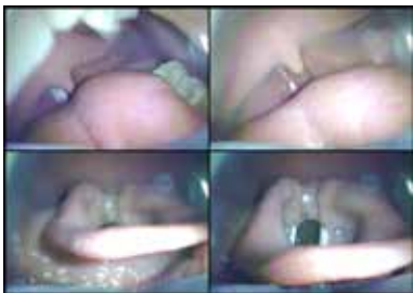
Realistic airway for intubation with flexible jaw and tracheal landmarks

All TraumaFX Products are handcrafted in the USA